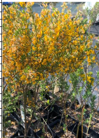
^Aotus ericoides (woodland form)